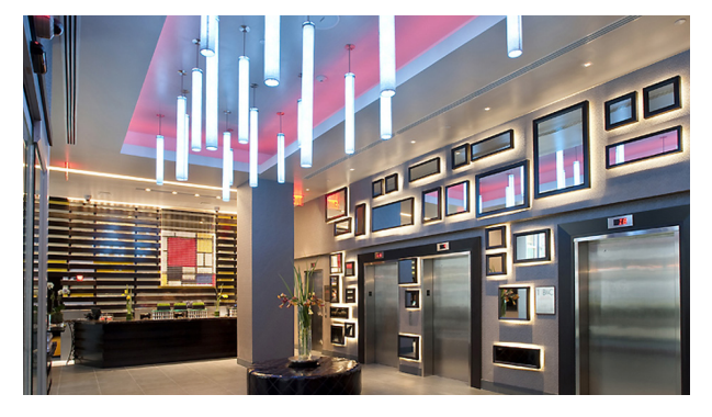
STRATEGIC PARTNER KONE tailored its maintenance programs to the specific requirements of the Hilton Worldwide hotels.