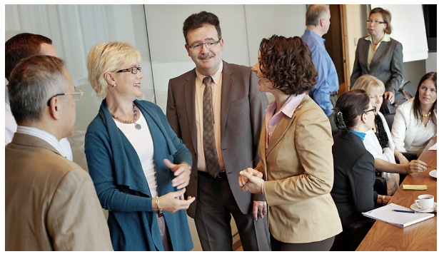
RESPONSIBILITY There is no finer way to ensure great customer service than by appreciating your employees.